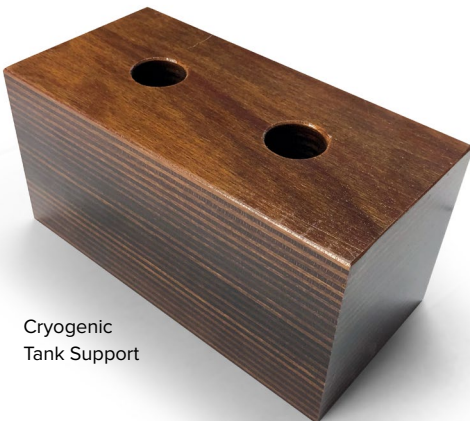
Cryogenic Tank Support

The following tabular data (on back side) have been developed and assembled to help the design engineer compare Insulam EH-5 and EH-6 under conditions of stress for liquid gas temperatures versus normal room temperature values. In all cases the figures shown are an average of a sufficient number of determinations to give a dependable result. Also, maximum and minimum values did not vary enough to require weighting of the average.