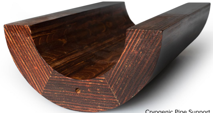
Cryogenic Pipe Support

Insulam EH has been proven in service by liquid natural gas (LNG) transportation and storage vessels. Successful land and sea applications include tank sealing rings, pipe saddles, tank supports, keys and pitch-and-roll chocks. Insulam EH coil forms are also in operation in a series of superconductivity studies involving a liquid helium environment.